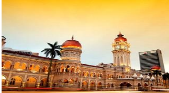
Sultan Abdul Samad Building