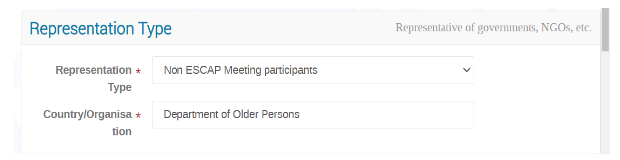
Step 2 Google Form Registration: please register via <a href="https://bit.ly/ESCAP80SideEventReg">https://bit.ly/ESCAP80SideEventReg</a> by 19 April 2024

3) Select "Non-ESCAP Meeting participants" and type to add the organization name (if you can't find it from the drop-down menu), and proceed to complete the rest of the profile.