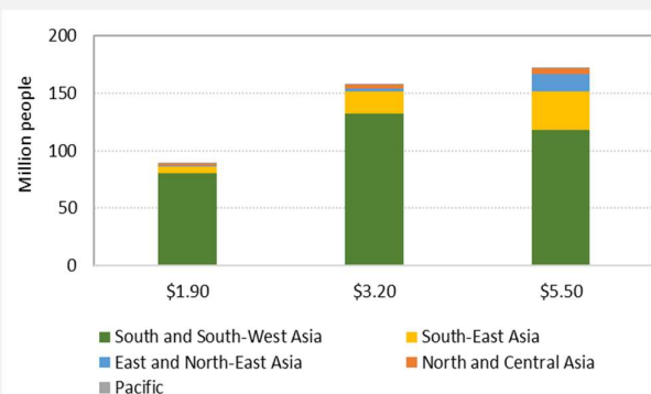
Figure 3 Number of people pushed back into poverty due to the COVID-19 pandemic, by subregion (millions of people)

The application of this framework to all Asia-Pacific developing countries finds that the pandemic could increase the poverty headcount by 89 million at the $1.90-a-day poverty line, 158 million at the $3.20-a-day poverty line and 172 million at the $5.50-a-day poverty line by 2021. South Asia, India in particular, accounts for the bulk of this increase in poverty, as the subregion is among the worst affected ( figure 3 ). The QGC model covers 18 countries and 54 per cent of the population, compared with the NDG coverage of 18 countries and 44 per cent of the population.