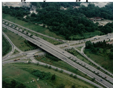
AH2: Bukit Timah Expressway