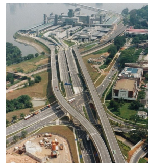
AH2: Woodlands Checkpoint